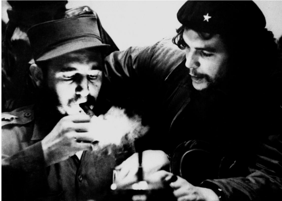
Mr. Castro with Mr. Guevara in Havana in January 1959.