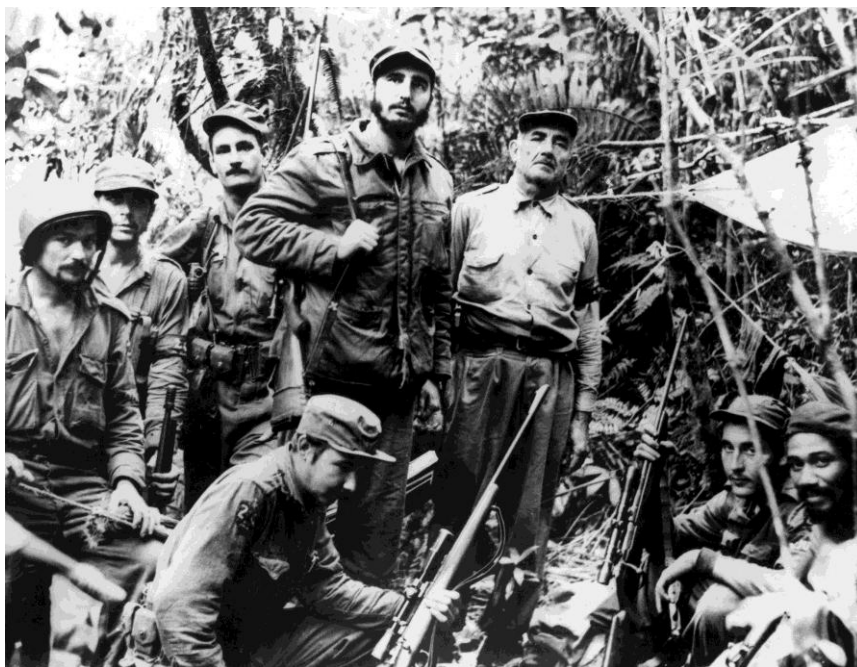
Mr. Castro with other rebel leaders at a secret base in June 1957 including Che Guevara, the guerrillas' physician, second from left, and Mr. Castro's brother Raúl, kneeling in the foreground.

The Granma remains on display in Havana, encased in glass.