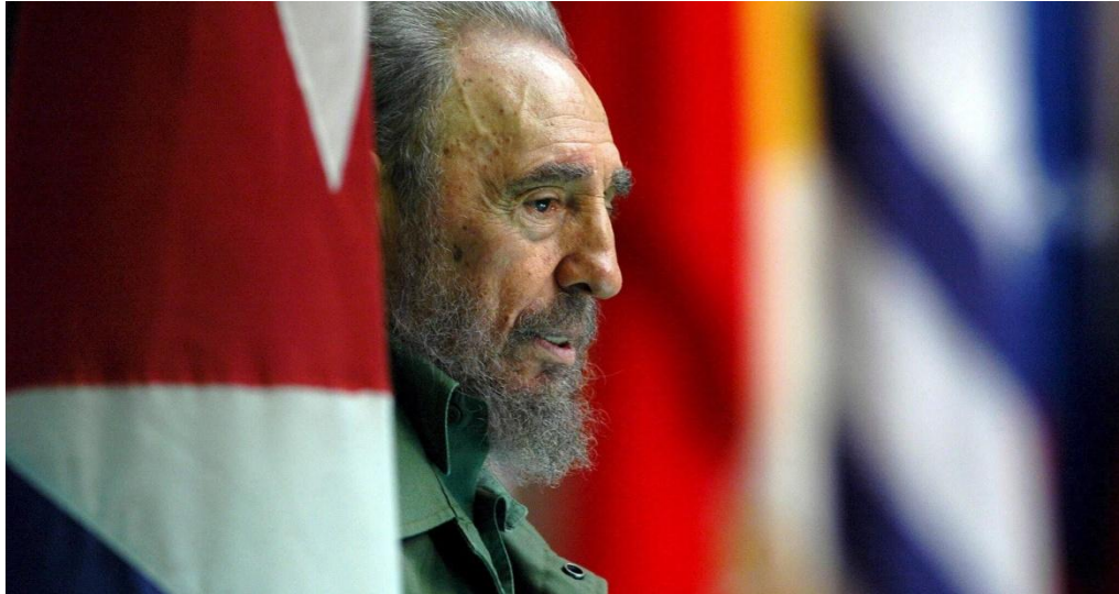
Mr. Castro in June 2006. His impact on Latin America and the Western Hemisphere has the earmarks of lasting indefinitely.

“For such a small country as Cuba to have such a gigantic country as the United States live so obsessed with this island,” he said, “it is an honor for us.”